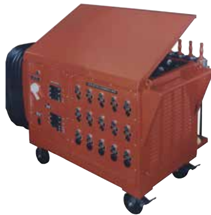
The "Outage Master" Distribution Center