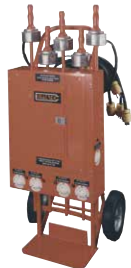
Portable Distribution Center