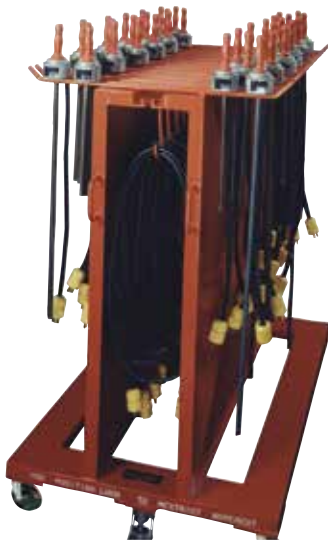
Bolt Heater Storage Cart